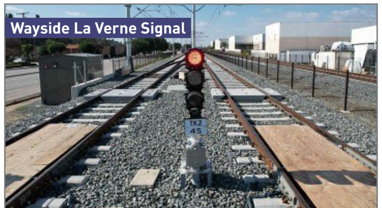
Wayside La Verne Signal