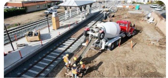
Crews constructing the plaza area for the future Glendora station.

San Dimas Station - At the future San Dimas station, crews are nearing completion on the installation of the decorative roof elements atop the canopy structures. As seen in the photos on the right, crews are currently installing diamond-shaped shingles on the boarding canopy, while having already installed the glass panels atop the ticket vending machine (TVM) canopy.