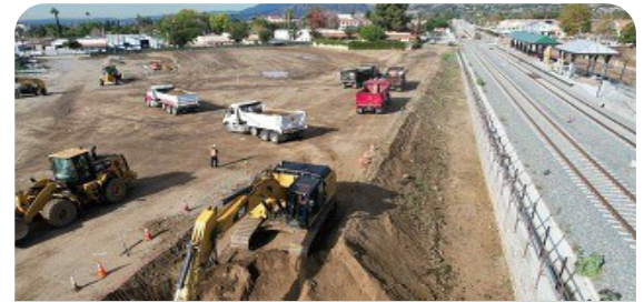
Crews constructing the future Glendora station parking facility.