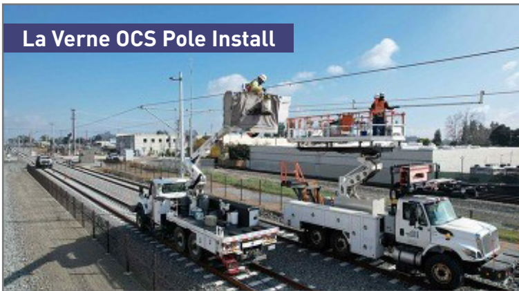
La Verne OCS Pole Install

Crews also continue to install miles of underground cables for the power, train control and communications systems (see below). Some of these underground cables are for the wayside signal lights that are currently being installed throughout the corridor as part of the train control system (see photo below). These wayside signals are located at the interlocking switches, and will let future light rail train operators know when it is safe to proceed through the corridor.