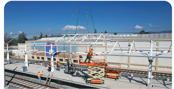
Crews installing the canopies for La Verne station.