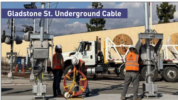
Gladstone St. Underground Cable