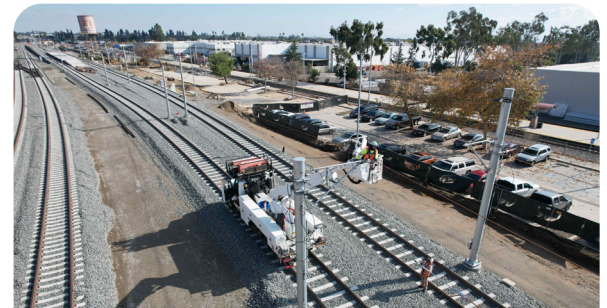
Future Pomona Station construction is underway. Crews are installing overhead wires just west through the station area.